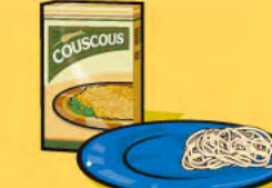
Cooked pasta or couscous 125 mL (½ cup)