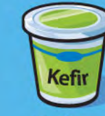
Kefir 175 g (¾ cup)