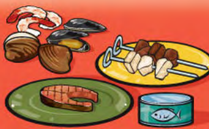
Cooked fish, shellfish, poultry, lean meat 75 g (2 ½ oz.)/125 mL (½ cup)