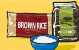
Cooked rice, bulgur or quinoa 125 mL (½ cup)