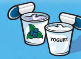
Yogurt 175 g (¾ cup)