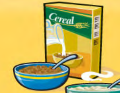
Cereal Cold: 30 g Hot: 175 mL (¾ cup)