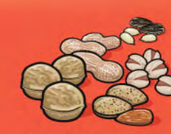
Shelled nuts and seeds 60 mL (¼ cup)