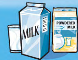
Milk or powdered milk (reconstituted) 250 mL (1 cup)