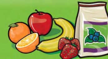
Fresh, frozen or canned fruits 1 fruit or 125 mL (½ cup)