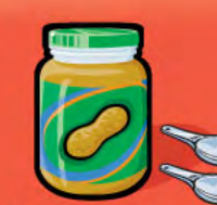
Peanut or nut butters 30 mL (2 Tbsp)