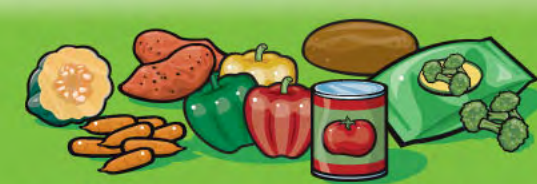
Fresh, frozen or canned vegetables 125 mL (½ cup)