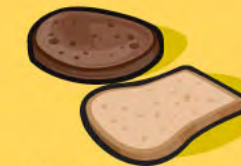
Bread 1 slice (35 g)