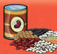
Cooked legumes 175 mL (¾ cup)