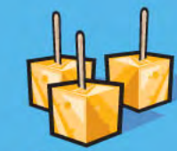
Cheese 50 g (1 ½ oz.)