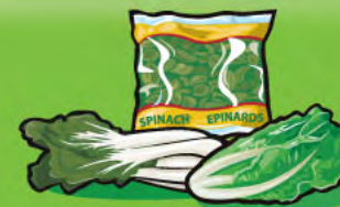
Leafy vegetables Cooked: 125 mL (½ cup) Raw: 250 mL (1 cup)